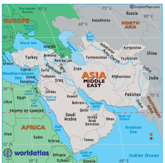
The Euphrates leaves from Turkey, crosses Iraqand flows into the Indian Ocean.

inheritance (Jeremiah 6: 14). This fact shouldn't surprise us because the demons are behind the armies of this world.